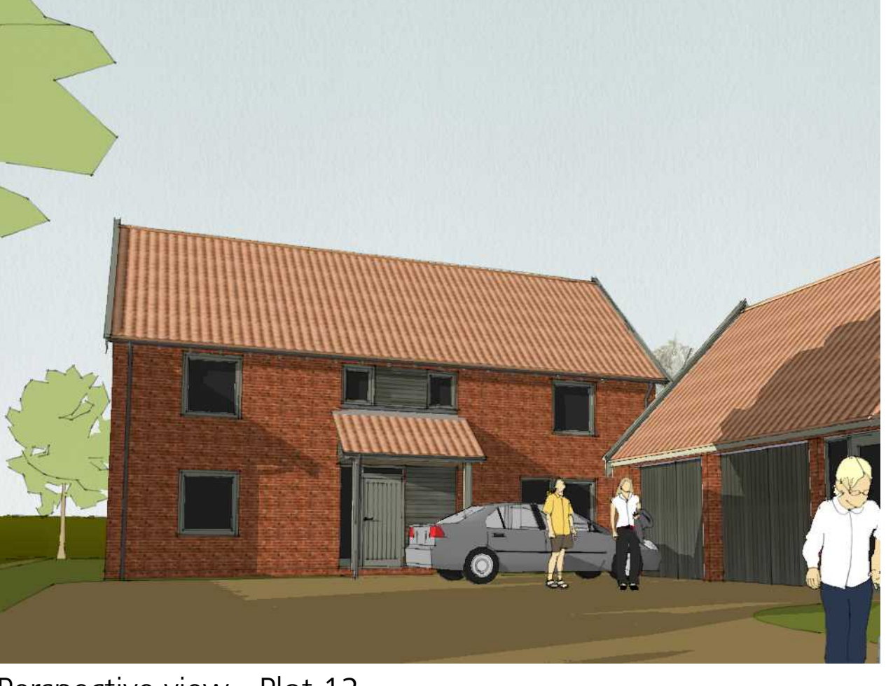
Perspective view - Plot 12